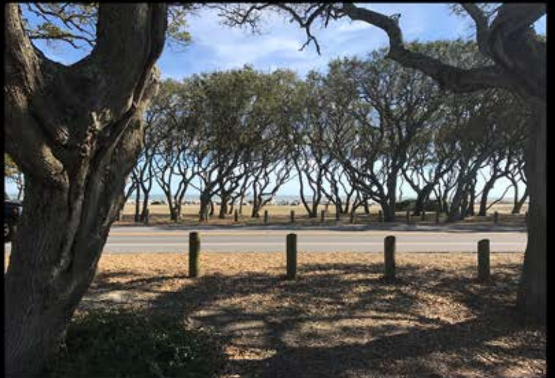
Fort Fisher, NC

Check out the new Military Writers Society of America 2016 Anthology, Gettysburg Inspirations inside.